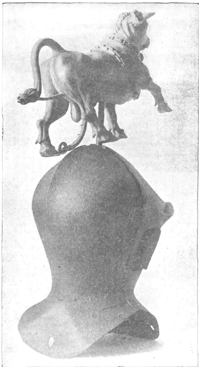
THE NEVILL HELM. Back View.